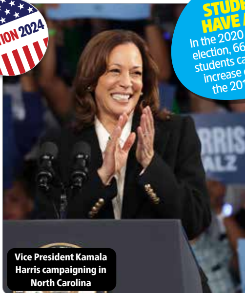
Vice President Kamala Harris campaigning in North Carolina

In the 2020 Presidential election, 66% of college students cast ballots, an increase of 14% over the 2016 election.