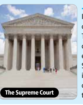
The Supreme Court

If the electoral votes are split evenly, Congress decides the winner. If the popular vote is close in a state, candidates can ask for a recount there. In the 2000 race between Texas Governor George W. Bush and Vice President Al Gore, this happened in Florida. Bush won the election.