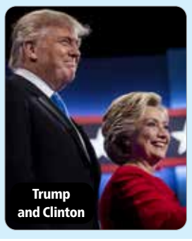
Trump and Clinton

The Electoral College can sometimes create an unclear outcome in an election, especially because there is an even number of electors (538).