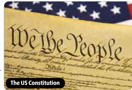
The US Constitution

On November 5, Americans will go to the polls to choose the next US President. Many will already have mailed in their ballots. But the process isn't as simple as checking off the candidate they want to win. Voters pick a President by name on the ballot, but they're not actually choosing that person—they're voting for members of the Electoral College.