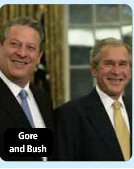
Gore and Bush

The winner of the electoral vote is President. This happened in 1824, 1876, 1888, 2000, and 2016. In 2016, Hillary Clinton won the popular vote by nearly 3 million votes, but Donald Trump won the electoral vote 304–227.